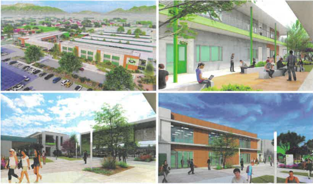
EISENHOWER HIGH SCHOOL - NEW CLASSROOM BUILDINGS BUILDING 2 EXTERIOR PERSPECTIVES SCHEMATIC DESIGN PALO ALTO UNIFIED SCHOOL DISTRICT | BLDG#1 - 2 & 3 | 18.2020